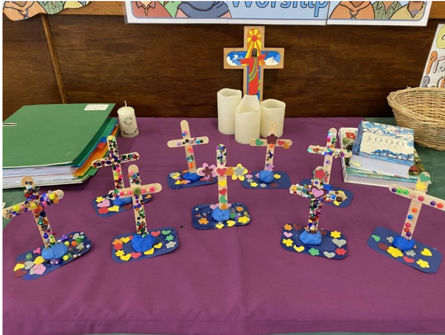
Easter works of art designed and created by Reception.