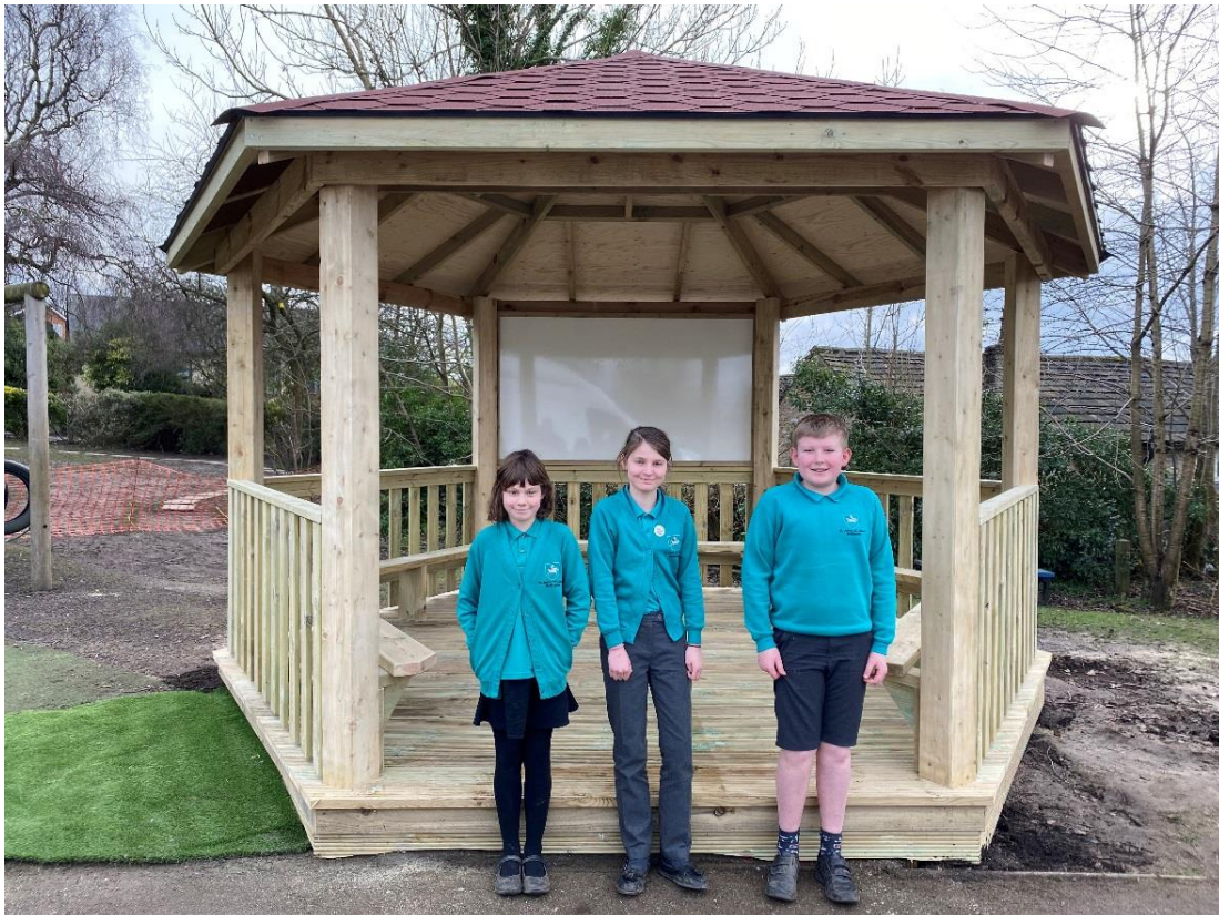
Year 6 School Council officially opening the gazebo.