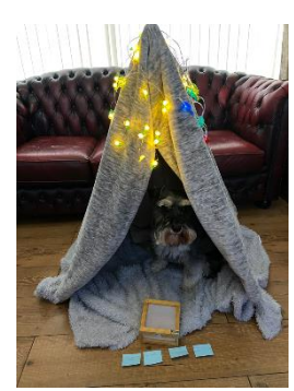
Page | 12